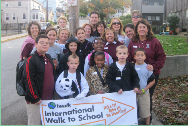
STUDENTS, PARENTS AND TEACHERS PROMOTE THE INTERNATIONAL WALK TO SCHOOL DAY IN EAST PROVIDENCE.

235 Promenade St., Suite 550 | Providence, RI 02908 | ph: 401-273-5711, ext. 4 | info@rictc.org